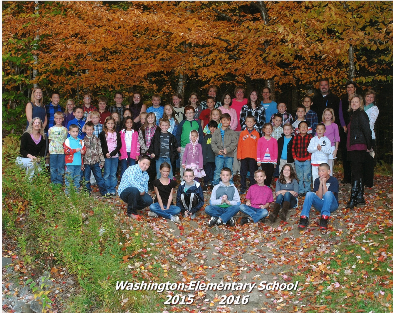
Washington Elementary School 2015 - 2016